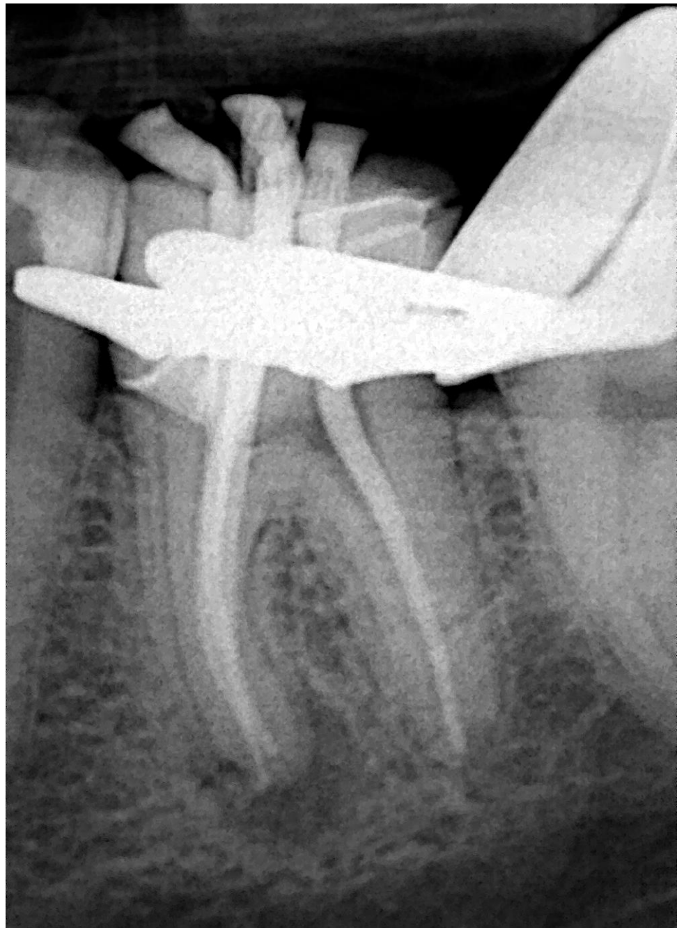
Radiografía de cono maestro